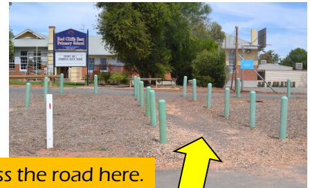
Please cross the road here.

The start of the school year always offers a timely opportunity to remind our students and parents of the appropriate area to cross the road at the front of the school. Green bollards near the large blue school sign indicate the safest place to cross the road. A staff member will always be on duty to assist people across the road safely. Please do not cross anywhere else as it can be difficult for drivers to see people when they enter the road from between parked cars. The road is not marked as a designated crossing but the bollards indicate the correct place to cross, with the assistance of a staff member.