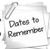
Table Talk Thursday

Each week we will be adding a question to the newsletter for families to use to ignite conversations around the dinner table. This week's question to ask each other is