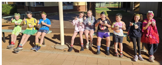
All the members of the Student Wellbeing Team enjoying their fruit/jelly cups.